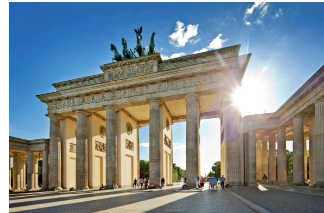
Brandenburger Tor, Berlin