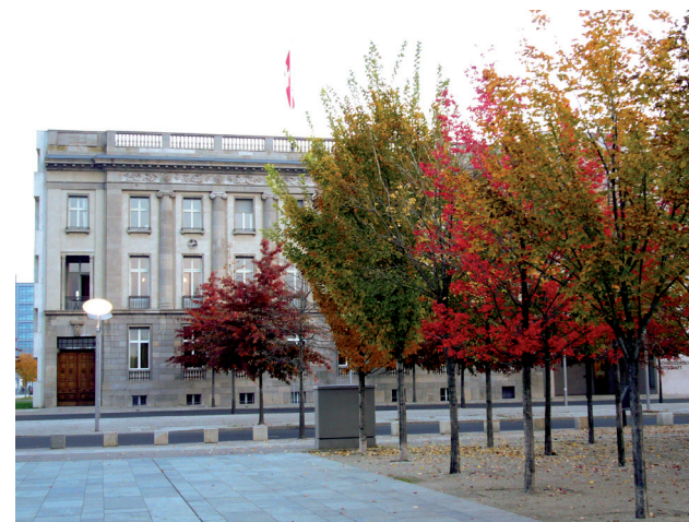
Schweizer Botschaft, Berlin