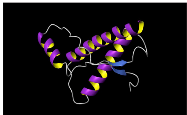
Fig. 1: The three dimensional structure of the intact bovine cellular prion protein